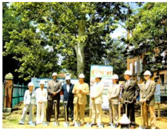
Roberts Place Groundbreaking Jun, 2006.

renovation of the historic Enright School into 72 apartments and construction of 24 new 3,000 square foot single family homes. The single family homes are designed to meet the LEED (Leadership in Energy Efficient Design) standards for environmentally sustainable and responsible development. Roberts Place will be a gated community with 24/7 on-site security and free broadband Internet access to all apartments and homes.